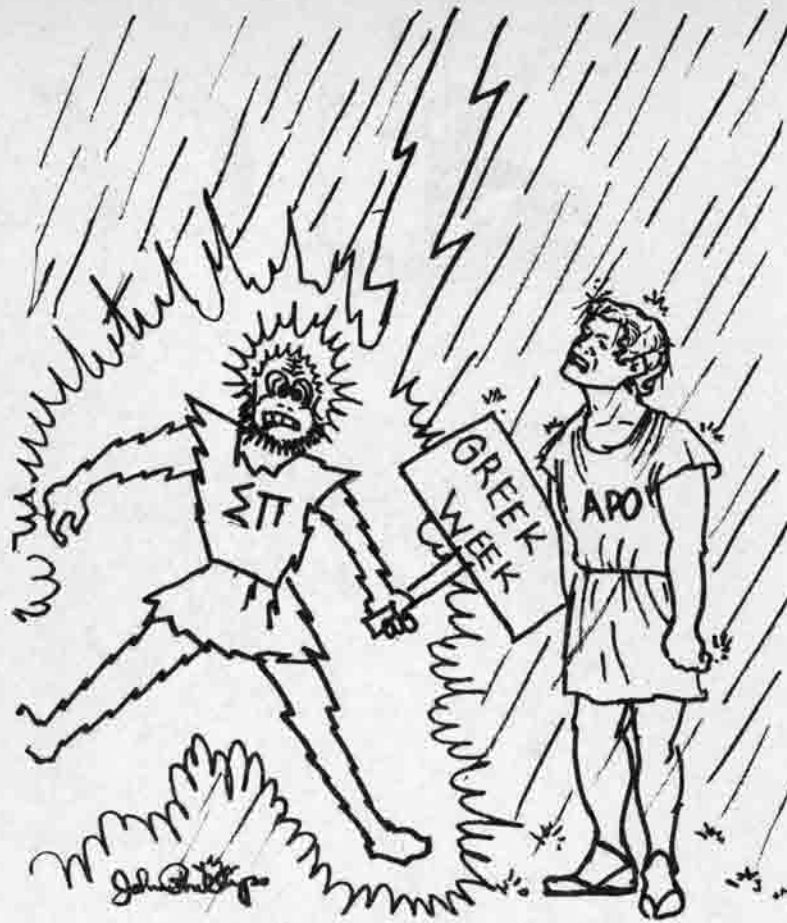
"Zeus must be angry!"

We were disturbed when the Board of Curators announced that UMSL was losing its "at," its colors, and its seal, but now we're really mad. We just learned that the University of Missouri seal, which is now UMSL's seal too, has a bear on it. This is the proverbial last straw. In fairness to UMSL, we demand that the bear be removed from the seal and replaced by that proud symbol of our campus, the UMSL duck!